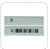
EAS-CDR: AM Soft Label