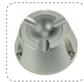
EAS-D10N: Universal Detacher 10000GS