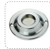
EAS-D01: Normal Detacher 4500GS