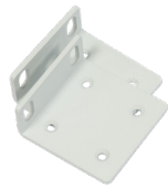
Rackmount bracket white