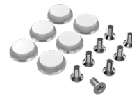
Fastening set for rackmount case