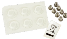
Screw and feet kit (K10)