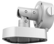
DS-1283ZJ Wall Mount (3-axis Adjustment)