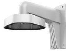
DS-1273ZJ-DM25 Wall Mount