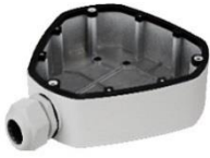
DS-1280ZJ-DM25 Junction Box