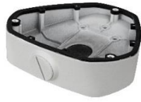
DS-1281ZJ-DM25 Inclined Ceiling Mount