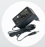
24V 0.8A Adapter