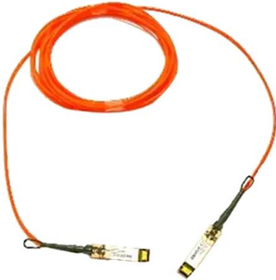
Figure 5. Cisco direct-attach active optical cables with SFP+ connectors

Cisco SFP+ Active Optical Cables (Figure 5) are direct-attach fiber assemblies with SFP+ connectors. They are suitable for very short distances and offer a cost-effective way to connect within racks and across adjacent racks. Cisco offers Active Optical Cables in lengths of 1, 2, 3, 5, 7, and 10 meters.